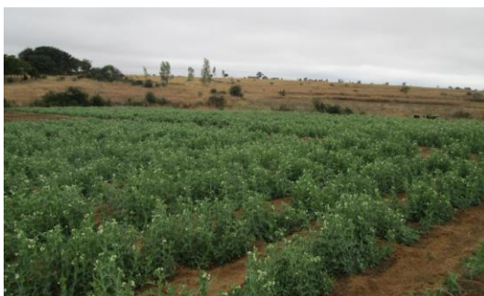
Fig 2: Peas grown using vermicompost as bio-fertilizer

The peas planted using the vermicompost is indicated in Fig 2. The peas shows vigor and vitality due to the bio-fertilizer addition as well as the action of the microbial inoculants present in the vermicompost to the soil.