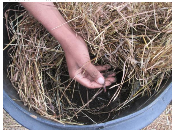
Fig 1: Vermicomposting being done in bins

The nutrient composition of the vermicompost is indicated in Table 1.